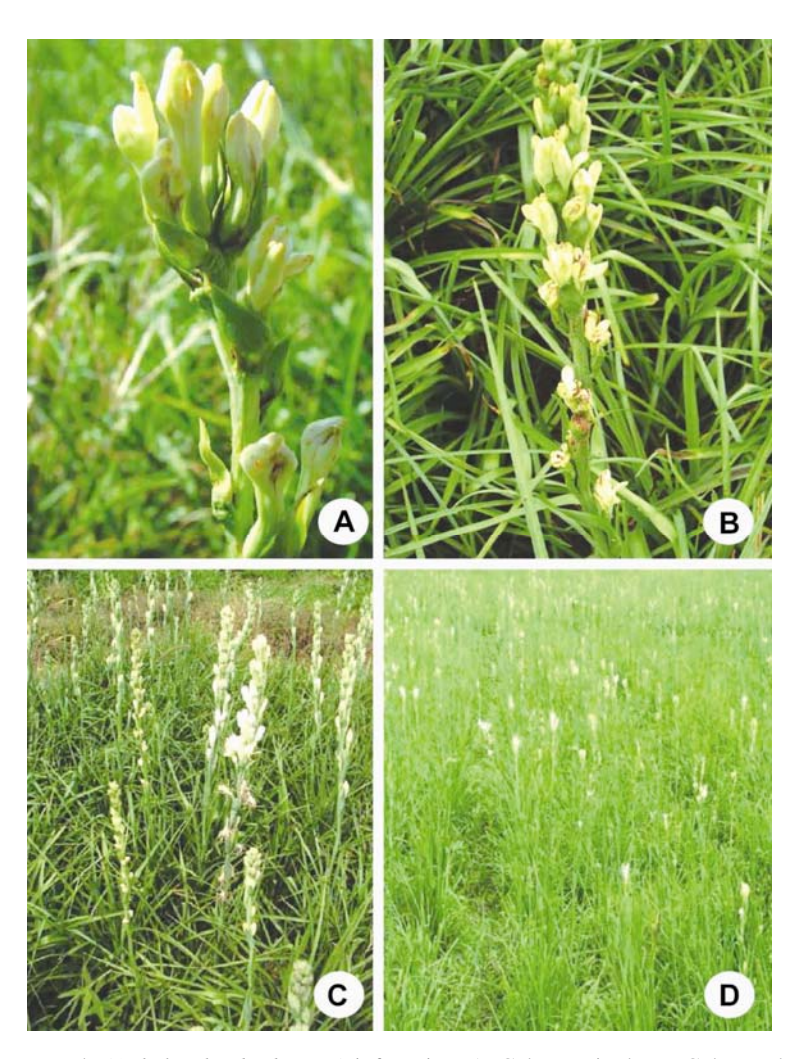
Fig. 2. Foliar nematode ( Aphelenchoides besseyi ) infestation: A. Calcutta single. B. Calcutta double. C. Field of Calcutta double and D. Field of Calcutta single.

in Nadia district (Table 2). In West Midnapore, population of plant parasitic nematodes recovered from crops rhizosphere were Meloidogyne spp. (29), R. reniformis (101), H. indicus (21), Helicotylenchus spp. (29), and Tylenchorhynchus spp. (31) (Table 3). From North 24-Parganas, plant parasitic nematodes recorded were Meloidogyne spp. (49), R. reniformis (74), Helicotylenchus spp. (24), Hoplolaimus indicus (32), and T. mashhoodi (29). Soils in Nadia district showed higher load of soil nematodes (985) followed by West Midnapore (847) and North 24-Parganas (401). The survey on plant parasitic nematodes infecting tuberose was further investigated during 2011-2012 (Tables 3,4). The major plant parasitic nematodes identified from